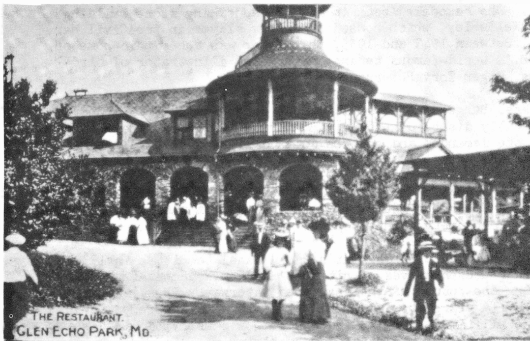
This granite structure was an activity center for Glen Echo Park in about 1907. This reprint of an old photo from the collection of Richard Cook is available in postcard form at the Park.